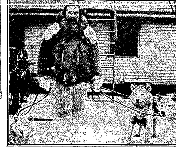
PEARY AND THE DOGS THAT TOOK HIM FARTEST NORTH