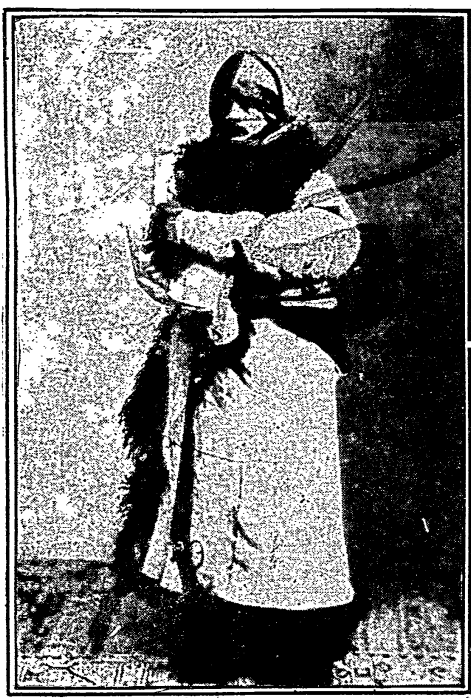
DR. FREDERICH COOK AS HE APPEARS WHEN IN THE ARCTIC AND AT HOME.