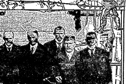
AMUNDSEN (AT LEFT) AND THE CREW THAT MADE THE NORTHWEST PASSAGE WITH HIM.